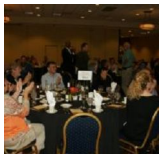
Photo gallery: 2014 Communications Marketing Conference (CMC) in Tucson

( https://urgentcomm.com/2021/01/29/ruggear-contributing-to-the-future-of-mission-critical-broadband-communication-review-and-market-vision/ )